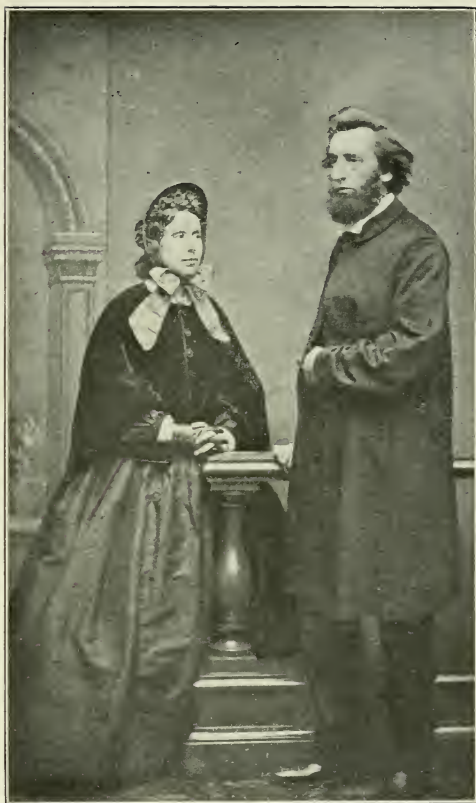
THE REV. WILLIAM AND CATHERINE BOOTH (1860)